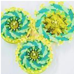
Particle robotics ( impressive video )