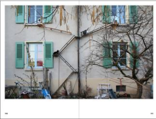
Swiss cat ladders