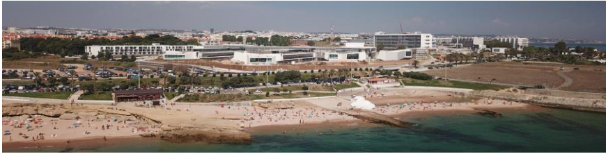
NOVA SBE campus

MIT combines research and teaching in the frontier, fun, a high-quality environment, and an industry orientation. It has also a pervasive skunkworks mindset present in many courses that became famous such as How To Make Almost Anything and the exceptional Product Engineering Processes , a high quality standard setter (read about this year's edition here ).